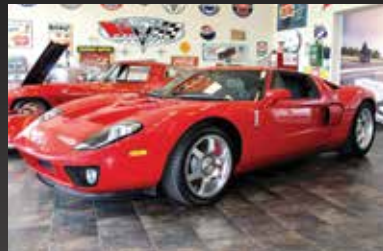
2005 FORD GT - 1531 MILES!