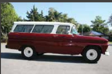
1961 CHEVROLET SUBURBAN