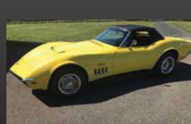
1969 CHEVROLET CORVETTE