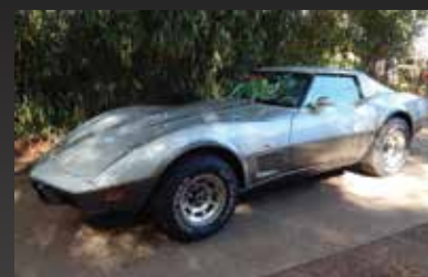
1978 CORVETTE - 212 MILES!