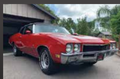
1972 BUICK GS STAGE 1

SEE 400+ CONSIGNMENTS ONLINE: CARLISLEAUCTIONS.COM