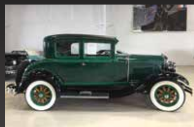
1928 PEERLESS VICTORIA OPERA