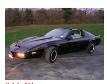
Knight Rider "KITT" TV & Movie Cars For Hire