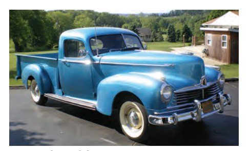
1947 Hudson Pickup Larry Creasy