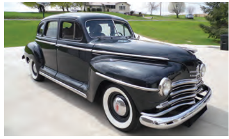
1948 Plymouth Special Deluxe Wayne Varner