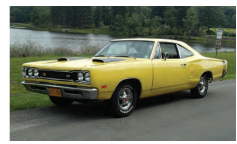
1969 Dodge Super Bee Stanley Sipko