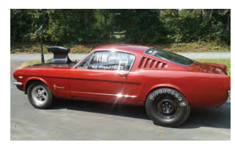
1965 Ford Mustang 2+2 Rick and Cathy Finnefrock