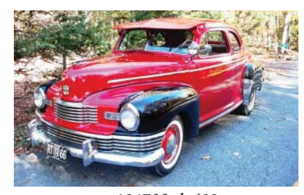
1947 Nash 600 Gary Maisel