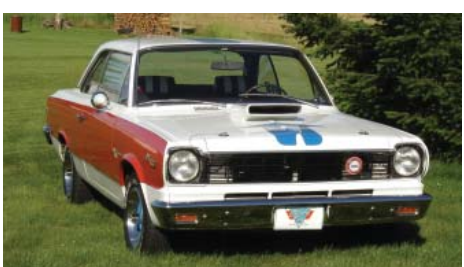
1969 AMC SC/Hurst Rambler Darrin Boeckel