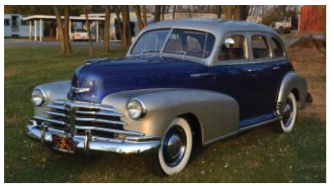
1948 Chevrolet Stylemaster Joshua Sigman