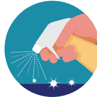
CLEAN AND DISINFECT FREQUENTLY TOUCHED SURFACES.