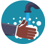
WASH YOUR HANDS OFTEN.