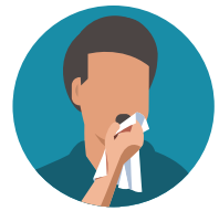
COVER COUGHS AND SNEEZES.