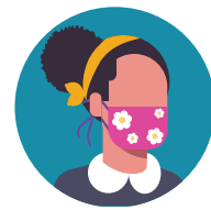
COVER YOUR MOUTH AND NOSE WITH A CLOTH FACE COVER WHEN AROUND OTHERS.