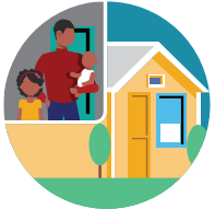
STAY AT HOME IF YOU ARE SICK.

We are looking forward to holding our 2020 auctions and are taking steps to help avoid the spread of COVID-19.